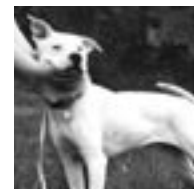
Misty Labrador retriever, pit bull terrier mix young female ID 06-1491 What a sweetie!