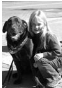
Winner! Best fundraiser under 18