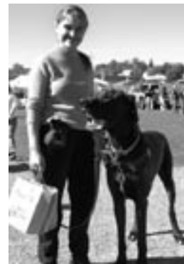
Winner! Largest dog