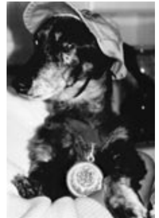
Winner! Oldest dog -16 years!