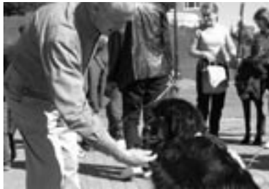
Winner! Best fundraiser