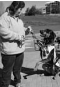
Winner! Best costume