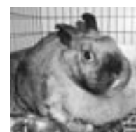
Peanut American mix young female ID 06-1435 A real cuddle-bunny who loves kids.