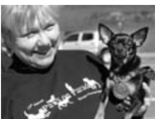
Winner! Smallest dog