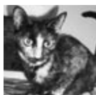
Henna Tortoiseshell adult female ID 06-1357B A little shy, but very sweet once she gets acquainted.