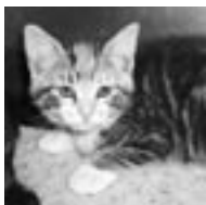
Ambrosia Domestic medium hair mix baby female ID 06-1609B Ready and waiting for a new home...