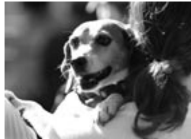
Catchin' a ride