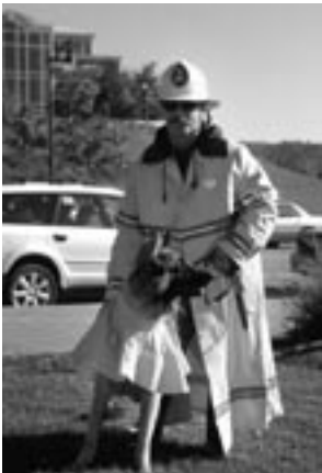
Winner! Best look-alike costume