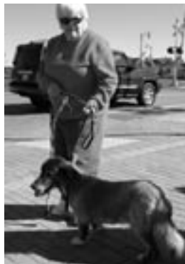
Winner! Most mixed mutt