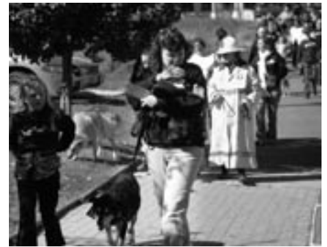
Lots of paws on parade - and some feet