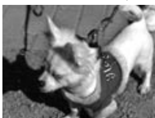
Winner! Youngest dog