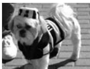
Winner! Longest distance traveled