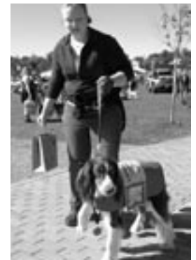
Winner! Longest tongue