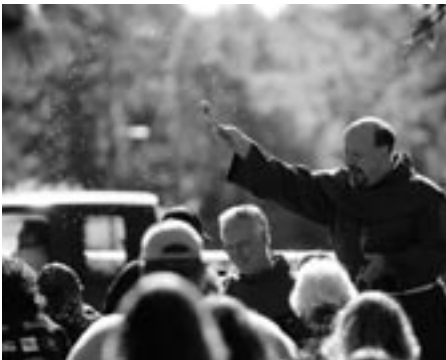
Blessing the animals

You all made Paws on Parade 2006 a great success!