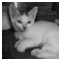
Bounce Domestic short hair baby male ID 06-1357F Who could be more cuddly?