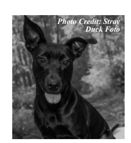
Thank you for your support!