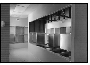
Moving cat adoptions to begin redesign