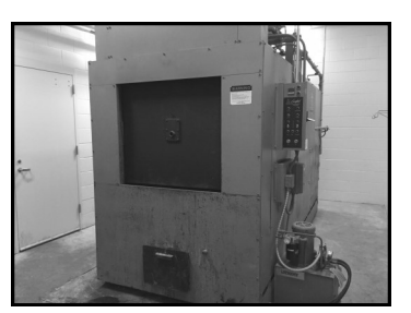
Unused for over 3 years, our incinerator was removed.