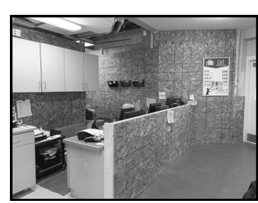
New, temporary customer service area