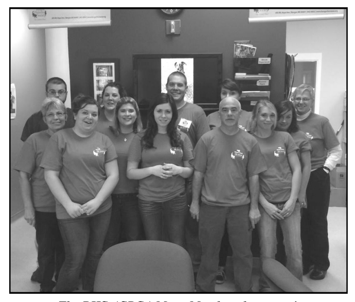
The BHS ASPCA Mega Match-a-thon team!