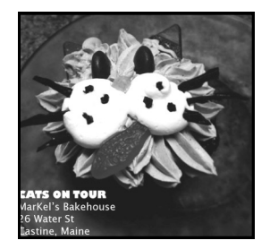
On October 11<sup>th</sup>, Markel's Bakehouse hosted a "Cats on Tour" event at their restaurant in Castine to showcase some BHS adoptable pets. The event raised nearly $600 in donations. Thank you Markel's!