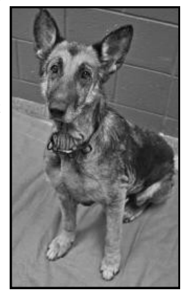
"Spirit" before treatment.

"I'm not sure who needed who more," he said, "but there is no doubt in my mind that we needed one another. And with the help, patience and generosity of the Bangor Humane Society, we are more complete and certainly happier because we are together."