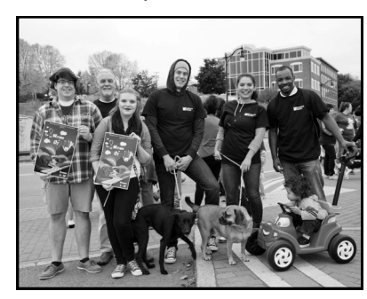
Penobscot Theater is partnering with BHS for the third consecutive year to help place homeless pets in homes for the holidays. At the beginning of each of their "Wizard of Oz" performances this season, they will feature an adoptable BHS dog. To date, the partnership has helped place over 40 dogs in new homes for the holidays. To learn more about performance dates and times visit www.penobscottheatre.org.