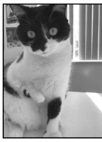
NyNy, formerly Footloose, found an adopter who embraced her physical deformity; she continues to show her gratitude by serving as a service cat, alerting her new person of various medical crises.