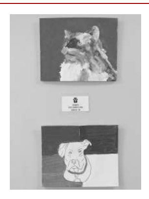
Students at Veazie Community School donated their animalthemed art work to brighten our lobby and hallway and to also encourage pet adoption.