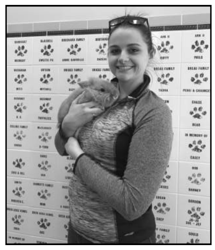
One of our bunnies hops happily into the arms of a new adopter!