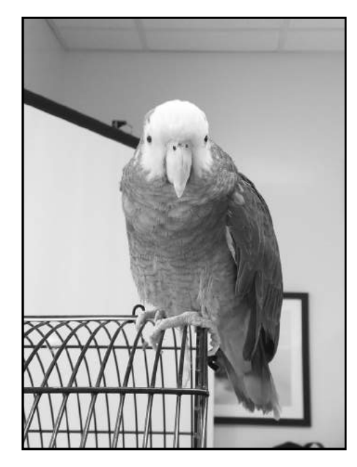
Percy, an under socialized African Parrot, was rescued from a pet hoarding situation and found a second chance with an experienced new owner.