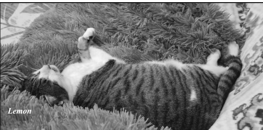
We love our frequent flyers who fall in love with our pets not once, but twice, three times and sometimes more! The Jordan family adopted Lemon, Blue, Joker and Tucker all in 2018!