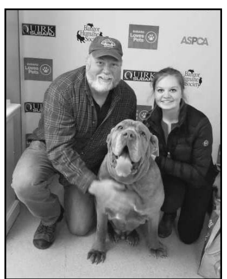
Tonka, the Neapolitan Mastiff, found his forever home with a family who spoils all 162 pounds of him!