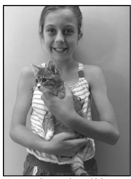
A young adopter smitten with her new kitten!