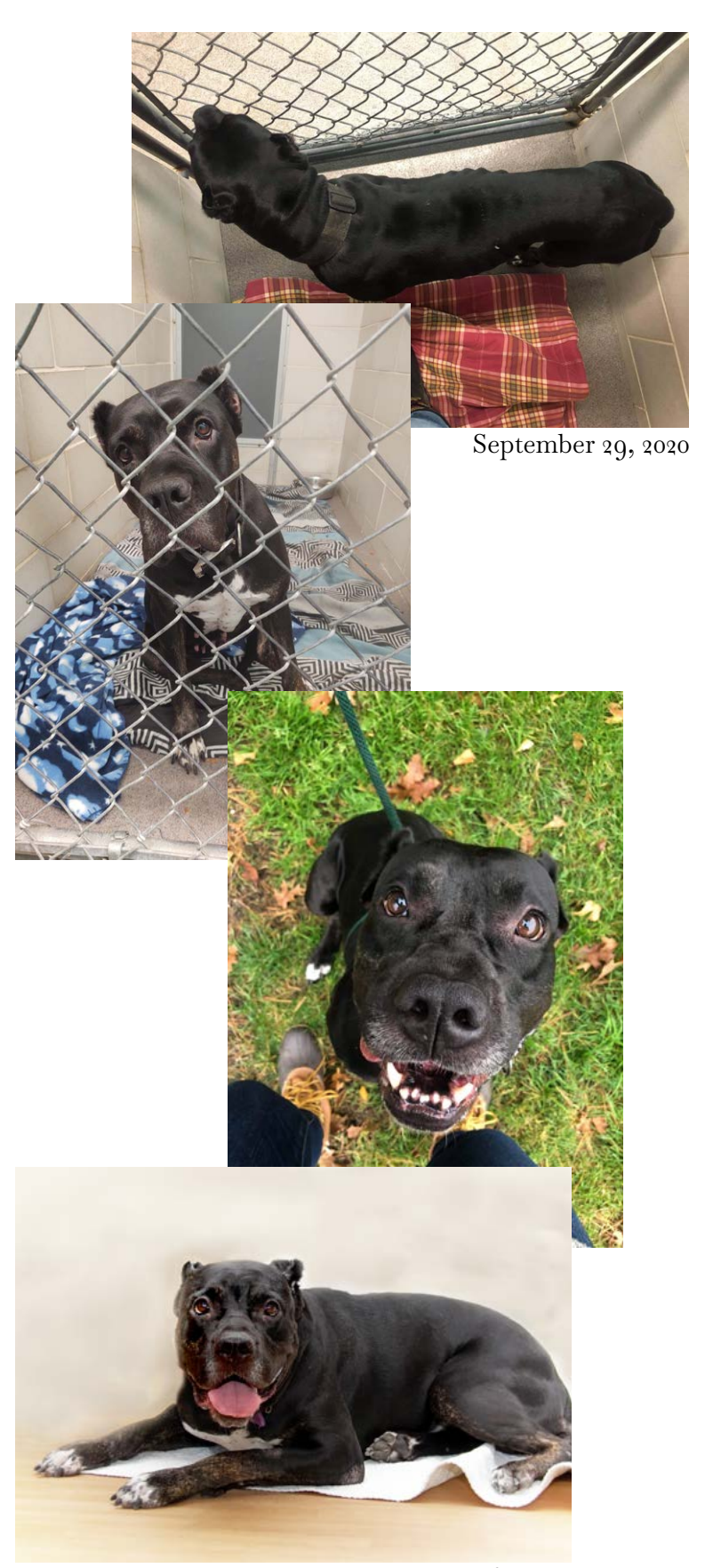
January 18, 2021

You can donate to our Second Chance Fund by visiting us at bangorhumane.org/donate and selecting Second Chance Fund from the drop down menu. Or by selecting Second Chance Fund on our return envelope.