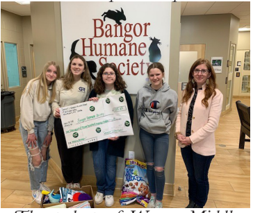
The students of Wagner Middle School's Student Council run a very successful change drive!