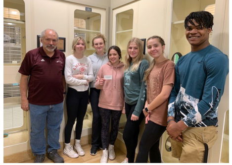
Foxcroft Academy Key Club sponsors a cat kennel.