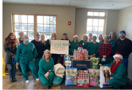
Husson's Kappa Delta Phi