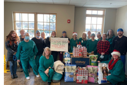
Bangor Dental Associates collects supplies.