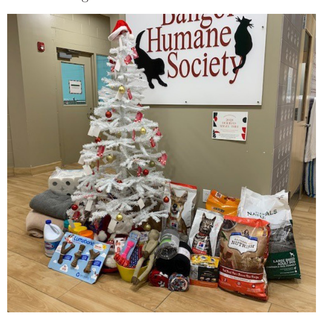
The Holiday Angel Tree features just a few of the many, many gifts of blankets, towels, food, toys, treats, pet beds, and cleaning supplies donated by the community.