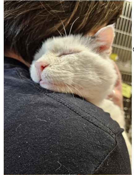
Moto Moto gets love

Your support is vital in maintaining these health protocols. Donations, volunteering, and fostering all make a significant difference in the lives of these cats. Allowing time for these friends to be quarantined and monitored means they receive a special diet when indicated, become better socialized with humans, and get the time they need to recover. By contributing, you help provide the necessary medical care and safe environment these animals need to thrive. Thank you.