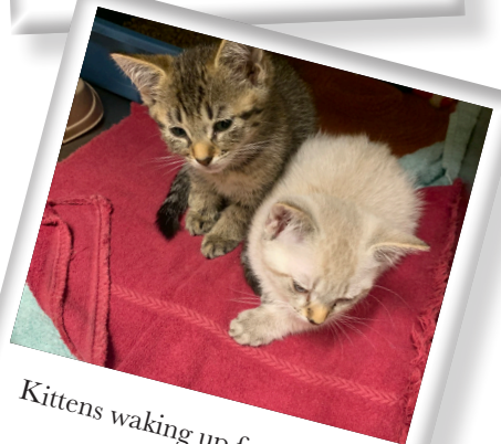
Kittens waking up from spay/neuter surgery.