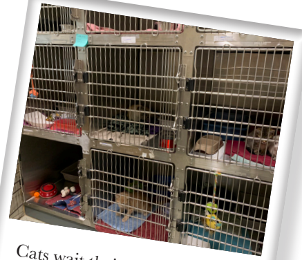
Cats wait their turn for surgery.

OUR LOW-COST ADOPTION SERVICES ARE MADE POSSIBLE BY OUR GENEROUS DONORS. PLEASE JOIN US IN SAVING MORE LIVES!