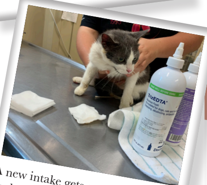
A new intake gets a quick check-up and an ear cleaning from our staff.