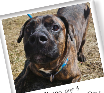
Bruno, age 4 Time in shelter: 1,057 Days Cost of Care: $21,000