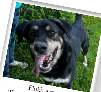
Floki, age 3 Time in shelter: 344 Days Cost of care: $5,500