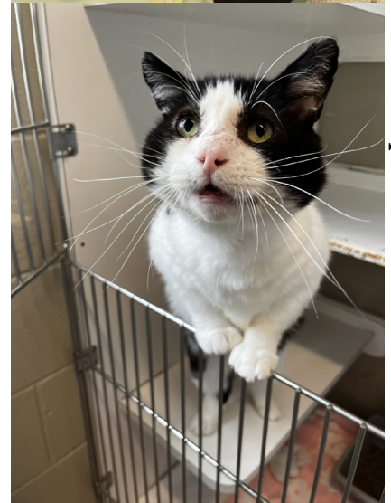
Conrad in quarantine