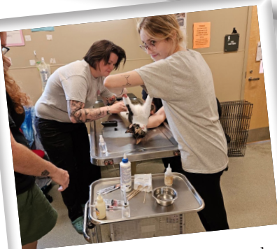
Staff completes a check-in and assessment- All hands on deck!