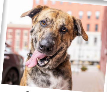
Bagheera, age 4 Time in shelter: 909 Days Cost of Care: $18,000